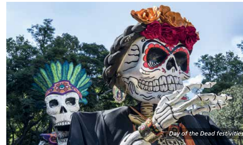
Day of the Dead festivities

Located on the northeastern tip of the Yucatan, Cancún is the gateway to Mexico's famous beaches and the starting point for self-drivers wanting to explore the peninsula independently. Jutting out between the Gulf of Mexico and the Caribbean, this stretch of coast is dubbed the Mayan Riviera, with over 100 miles of glorious beaches and turquoise waters. Year-round warm seas have encouraged large scale, all-inclusive hotels, but there are smaller boutique hotels to be found. Two hours to the north, the small island of Holbox offers a quieter alternative.