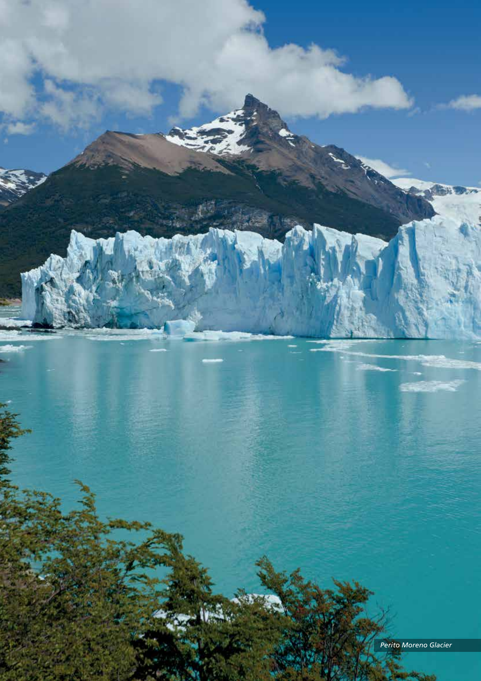
Perito Moreno Glacier

For wine aficionados, Mendoza in the west is the country's wine capital. Argentina is world-famous for making superb wines from the Malbec grape and here you can tour the vineyards, see how the wine is made and sample the results. The tranquil town of Cafayate in the north, set amongst spectacular Andean mountains, is Argentina's second wine centre and specialises in dry white wine made from the Torrontés grape.