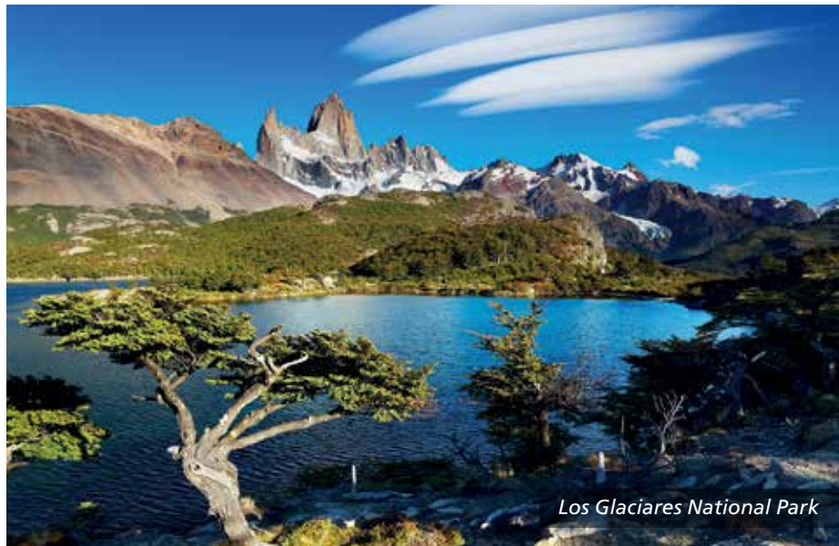
Los Glaciares National Park

In the southwest of the country the Lake District beckons, with fresh air and adventure. The scenic alpine city of Bariloche, with its strong German community, is an ideal base from which to explore the stunningly beautiful Nahuel Huapi National Park. Take in the pristine glacial lakes and verdant green landscapes, all with an Andean backdrop. An excursion into Chile's Lake District can also easily be arranged, with a scenic boat crossing to Puerto Varas.