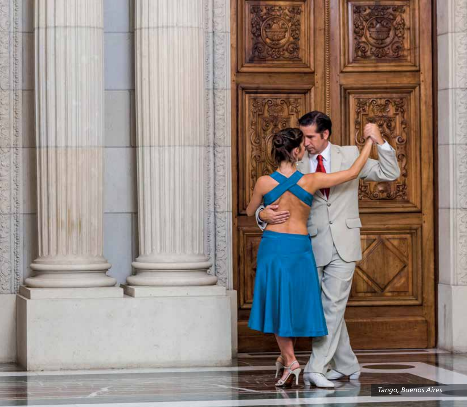
Tango, Buenos Aires