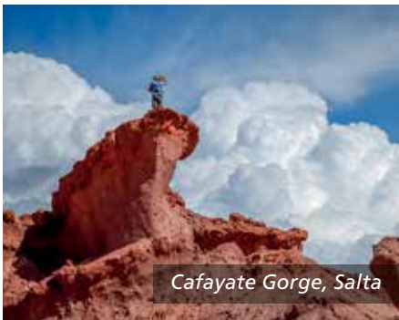
Cafayate Gorge, Salta

To view marine life, head to Puerto Madryn on the eastern Atlantic coast. The Valdés Peninsula is a site of global significance for the conservation of threatened marine species and you can expect to see elephant seal, penguin, orca and numerous seabirds. Southern right whales also breed here. The whale-watching season extends from May to December, but the best chances of sightings are in September and October. On land look for the rhea, an ostrich like bird, and the Patagonia fox. Interestingly there is a large Welsh Community that lives here.