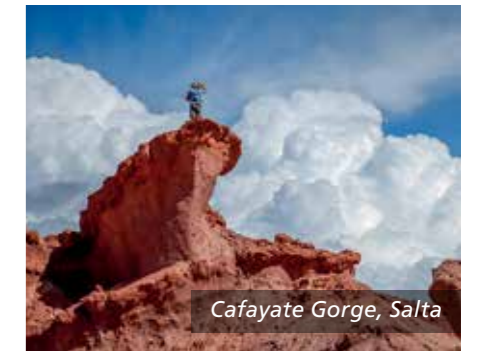
Cafayate Gorge, Salta