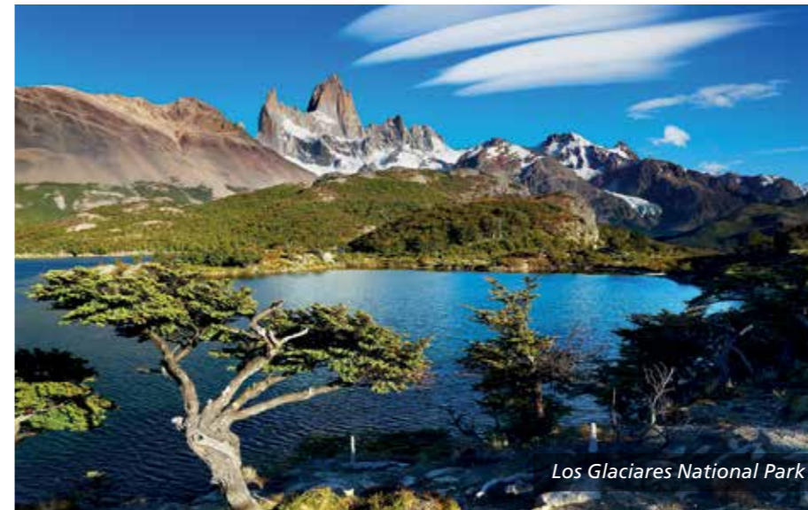
Los Glaciares National Park