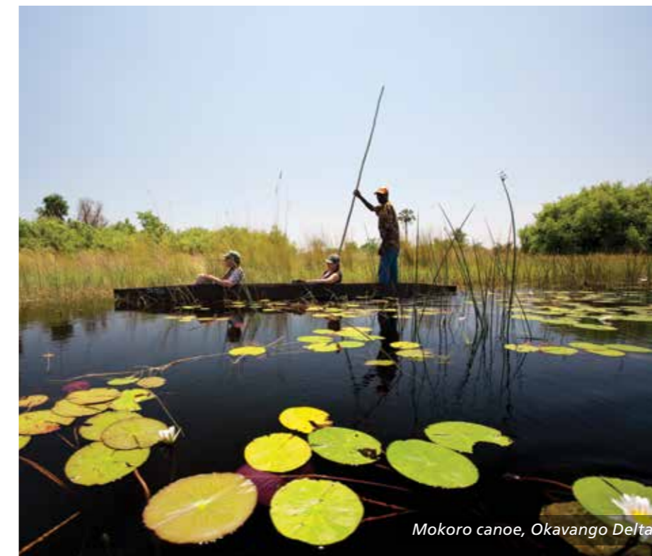
Mokoro canoe, Okavango Delta

To the northwest of Chobe, the Linyanti River marks the border of Botswana and Namibia’s Caprivi, and here river valleys and more open grassy plains are typical of the terrain. Lion, leopard and cheetah as well as many plains game and buffalo make their home here. This is one of the best places to see the endangered African wild dog and you may catch sight of an exciting hunt as a pack tries to chase down its dinner!