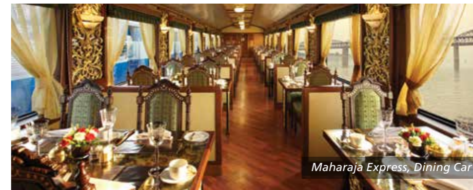
Maharaja Express, Dining Car

Although not a luxury train, another iconic train journey is aboard El Chepe, which travels through the stunning Copper Canyon.