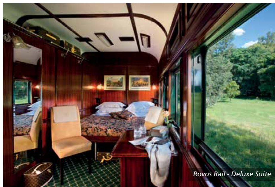
Rovos Rail - Deluxe Suite

The modern Blue Train also travels regularly between Pretoria and Cape Town.