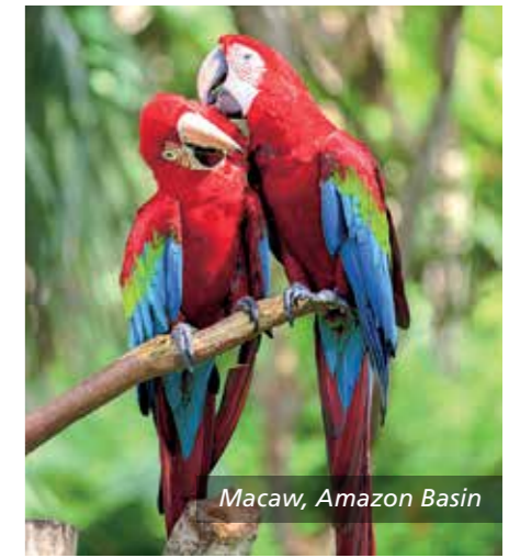
Macaw, Amazon Basin

The historic centre, known as the Pelourinho (Portuguese for ‘whipping post’, hinting at its dark past as a slave market), is a World Heritage Site with cobbled streets and a triangular main ‘square’. Today it is a hub for cultural and artistic attractions, restaurants and bars.