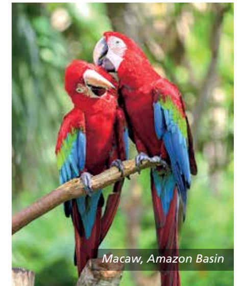
Macaw, Amazon Basin

The name Pelourinho comes from Portuguese for whipping post, which hints at its dark history as a slave market. Today it is a hub for cultural and artistic attractions, restaurants and bars. It was here that Michael Jackson famously filmed his music video They Don't Care About Us .