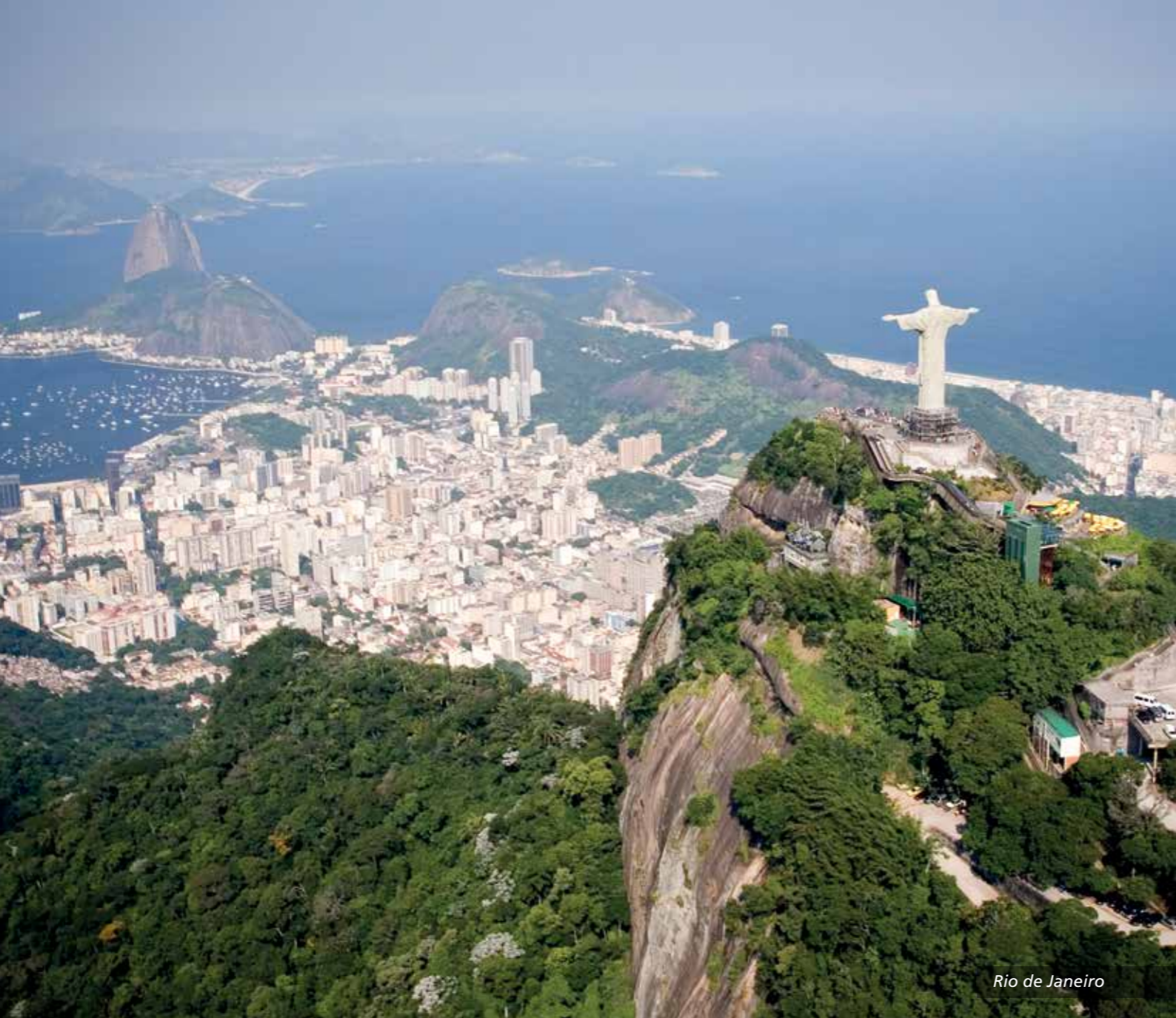
Rio de Janeiro