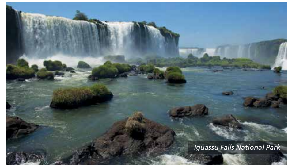
Iguassu Falls National Park

The thundering Iguassu Falls located in the southwest corner of Brazil are truly impressive and one of the greatest natural wonders in the world. With a network of over 275 different waterfalls, Iguassu is twice the size of Niagara and a UNESCO World Heritage Site. The gateway town of Foz do Iguacu offers easy access to both the Argentinian and Brazilian sides of the