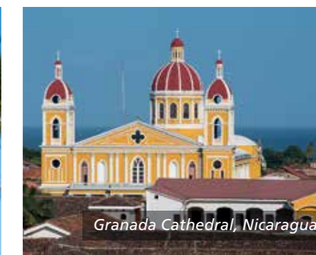
Granada Cathedral, Nicaragua