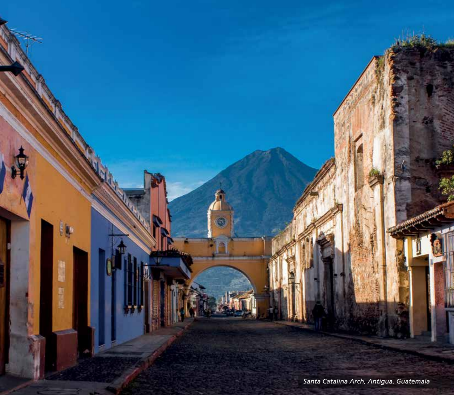
Santa Catalina Arch, Antigua, Guatemala