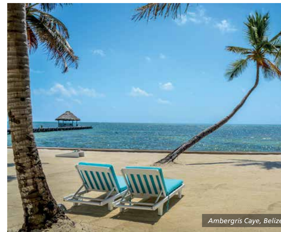
Ambergris Caye, Belize