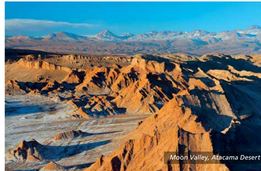
Moon Valley, Atacama Desert

Central. Barrio Lastarria, the Bohemian Quarter, is another must-see and on San Cristóbal Hill you will find the amazing Chilean Museum of Pre-Columbian Art. Santiago is the starting point for exploring the famous Chilean Winelands. The Maipo Valley, known for its exceptional reds, is the closest wine producing region to the capital and some of the oldest and best wineries are found here. The Casablanca Winelands, with their crisp white wines, are also within easy reach on a day tour.