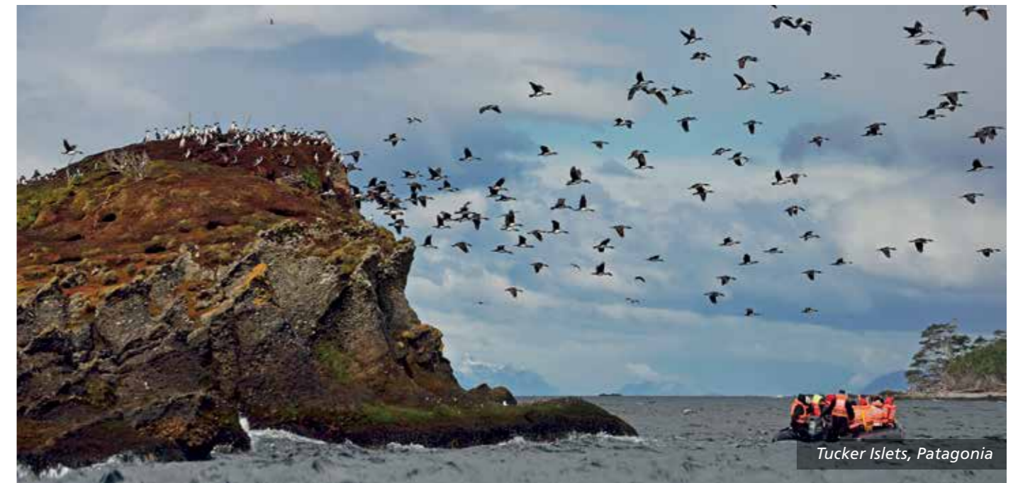
Tucker Islets, Patagonia

The Chiloe Archipelago is made up of hundreds of tiny islands, which were isolated for many years. These islands are known for their quaint wooden houses built over the water on stilts and their wooden churches. Rugged and wet, the area is rich in bird and marine life with whale watching from late January to April. This is one of the only places in the world where Blue whales gather to feed.