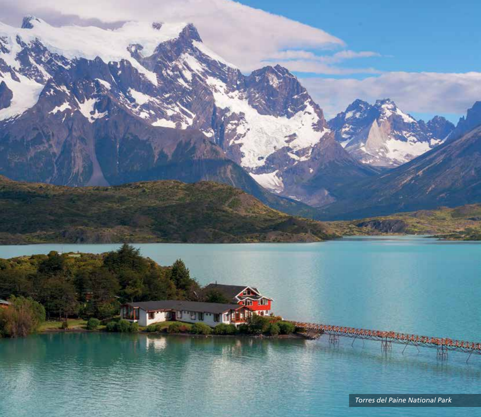
Torres del Paine National Park