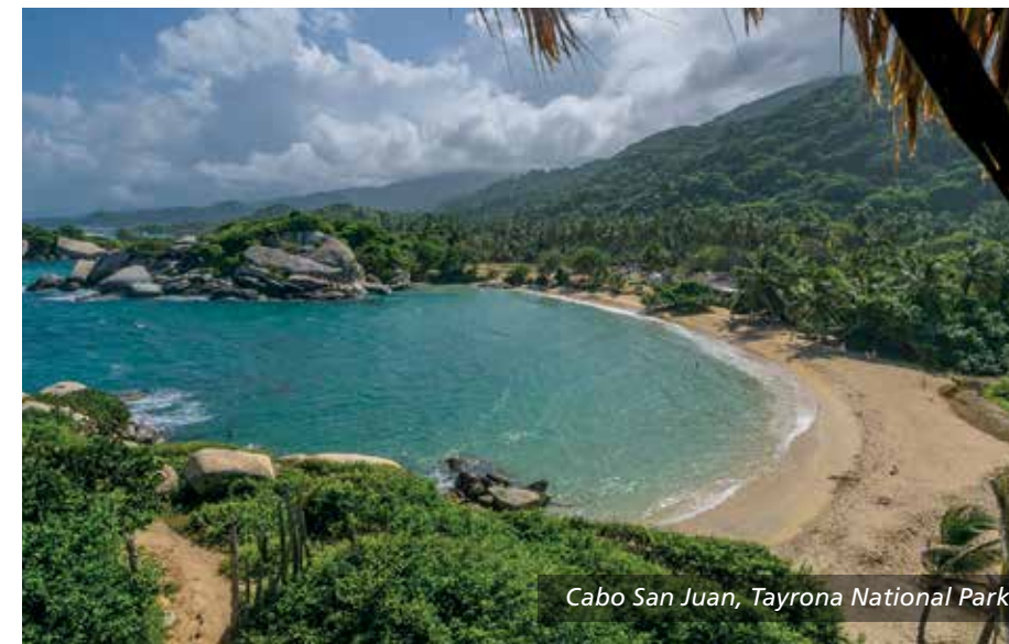
Cabo San Juan, Tayrona National Park

For spectacular views of the city take the cable car to the summit of Monserrate, at a height of 3,152 metres, or walk up if you are feeling energetic. Outside the city, visit the remarkable Salt Cathedral carved out from a former salt mine at Zipaquirá and don't miss Villa de Leyva, one of Colombia's most picturesque colonial villages. If adrenalin sports are your thing, head north of Bogota to San Gil and the Rio Fonce, Colombia's white-water rafting capital. Here you can also horse ride, fish and hike.