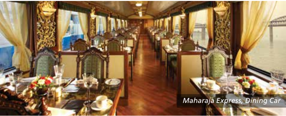
Maharaja Express, Dining Car

Although not a luxury train, another iconic train journey is aboard El Chepe, which travels through the stunning Copper Canyon.