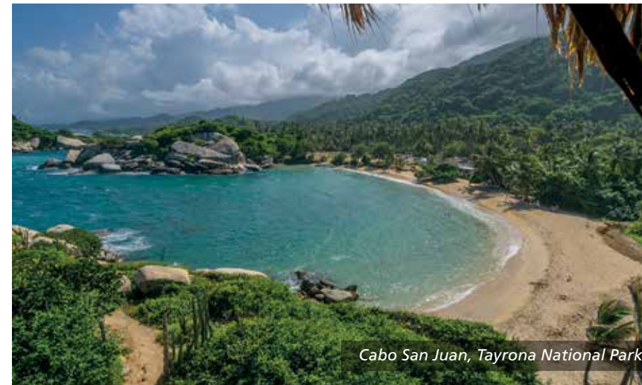
Cabo San Juan, Tayrona National Park

Colombian coffee is legendary and spending a few days at a 'finca' (estate) in the rolling hills of the Coffee Region, centred in Pereira, is a popular option. An excursion to the lush Cocora Valley, with its giant wax palms and condors, and colonial Salento is a must.