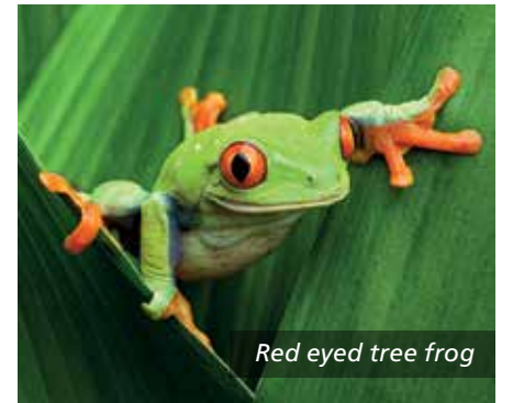
Red eyed tree frog