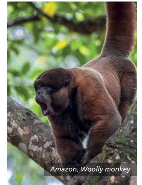
Amazon, Woolly monkey

In most South American countries the Amazon rainforest is never far away, and Ecuador is no exception. It occupies the entire eastern half of the country. Coca is the starting point for an Amazon trip, with most visitors taking the short flight from Quito and then continuing by boat. Staying in one of the comfortable eco-lodges in Yasuni National Park, with excursions led by indigenous guides, is the best way to experience the astonishing biodiversity. Nothing can prepare you for the beauty of the Amazon with its noisy