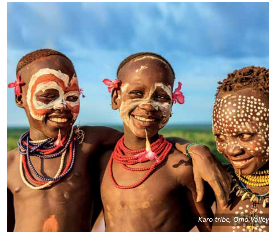
Karo tribe, Omo Valley

parks. In the north, the Simien Mountains National Park was created to protect the critically endangered Walia ibex, which clings to sheer rock faces. It is also home to the Gelada (bleeding heart) monkey and the rare Simien wolf (also known as the Simien fox or Abyssinian wolf). The open afro-alpine moorland of Bale Mountains National Park is also a good place to see a range of Ethiopia's endemic mammals, including the Simien wolf. As wildlife is relatively sparse, combining