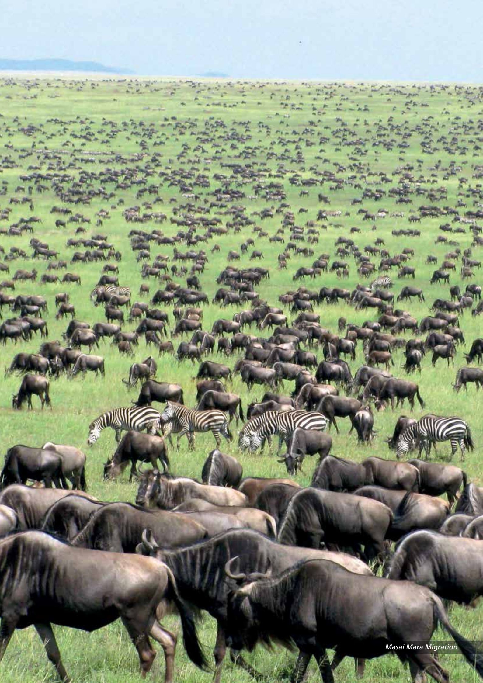
Masai Mara Migration