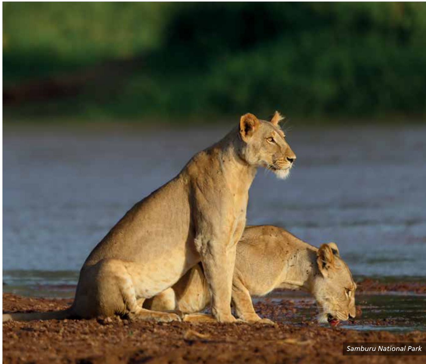
Samburu National Park