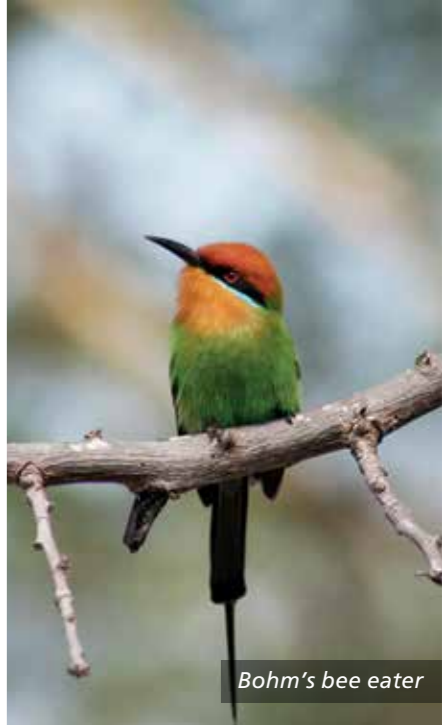
Bohm's bee eater