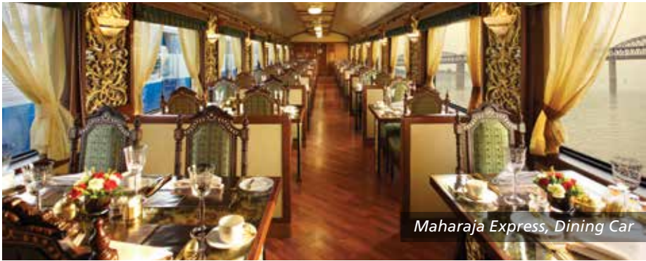
Maharaja Express, Dining Car

Although not a luxury train, another iconic train journey is aboard El Chepe, which travels through the stunning Copper Canyon.