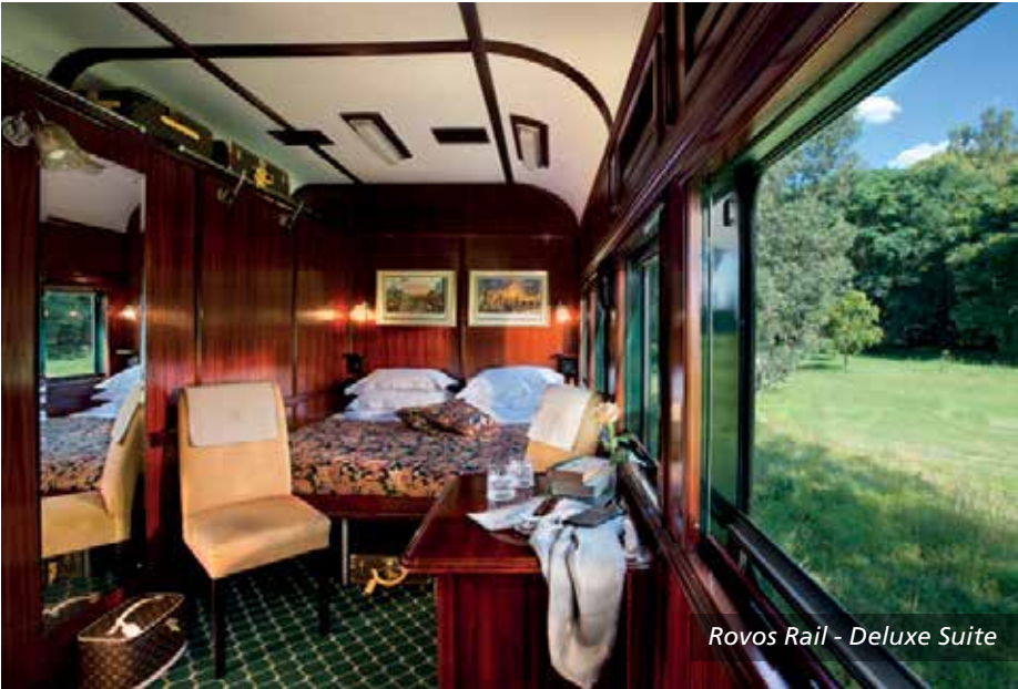
Rovos Rail - Deluxe Suite

The modern Blue Train also travels regularly between Pretoria and Cape Town.