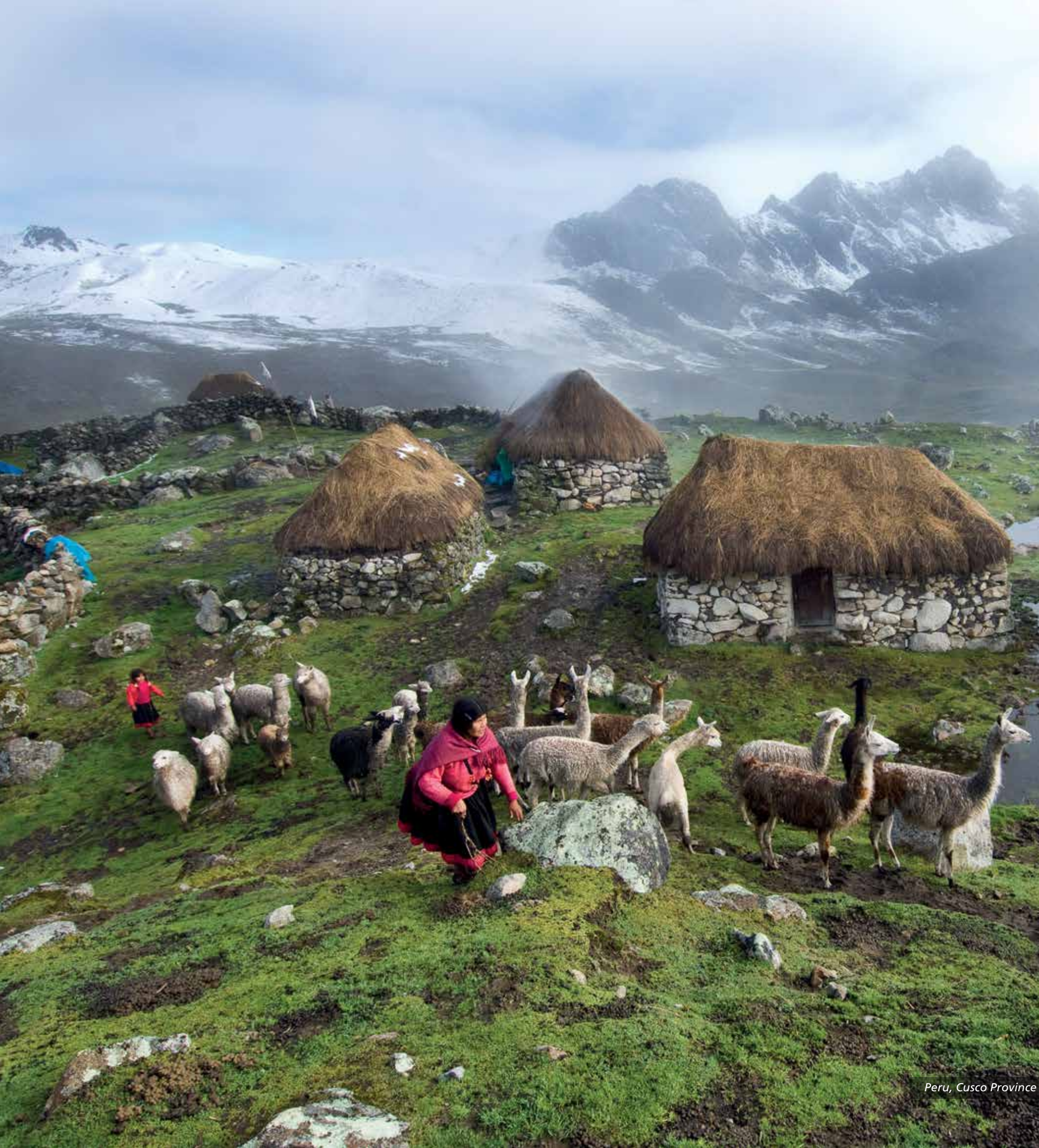
Peru, Cusco Province