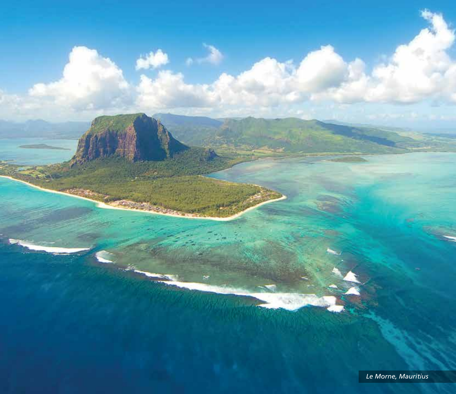
Le Morne, Mauritius