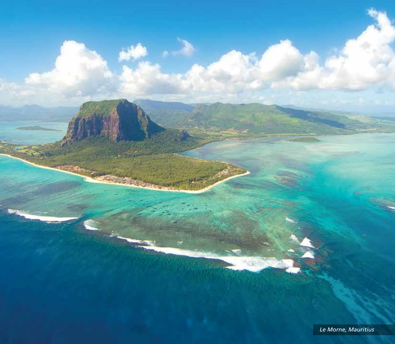
Le Morne, Mauritius