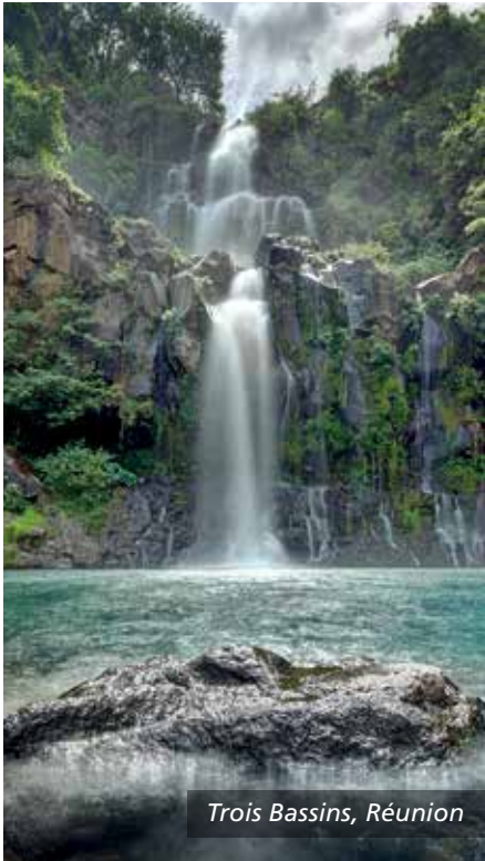
Trois Bassins, Réunion

Mauritius combines well with a safari in South Africa or Madagascar, or an activity-based holiday in nearby Réunion where you can hike, white-water raft, paraglide, horse ride and go canyoning.