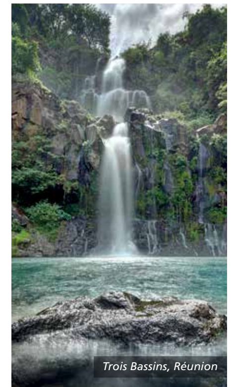
Trois Bassins, Réunion