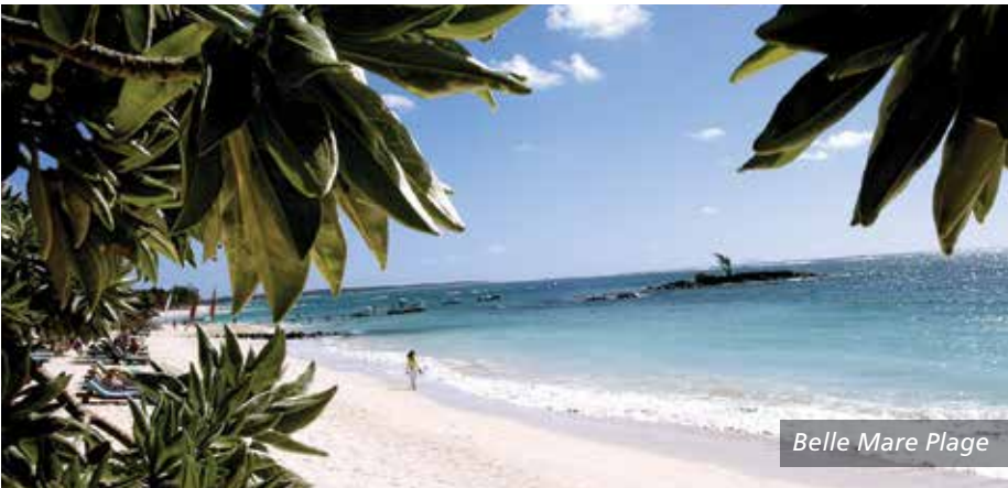
Belle Mare Plage