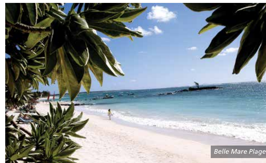
Belle Mare Plage

Mauritius combines well with a safari in South Africa or Madagascar, or an activity-based holiday in nearby Réunion where you can hike, white-water raft, paraglide, horse ride and go canyoning.