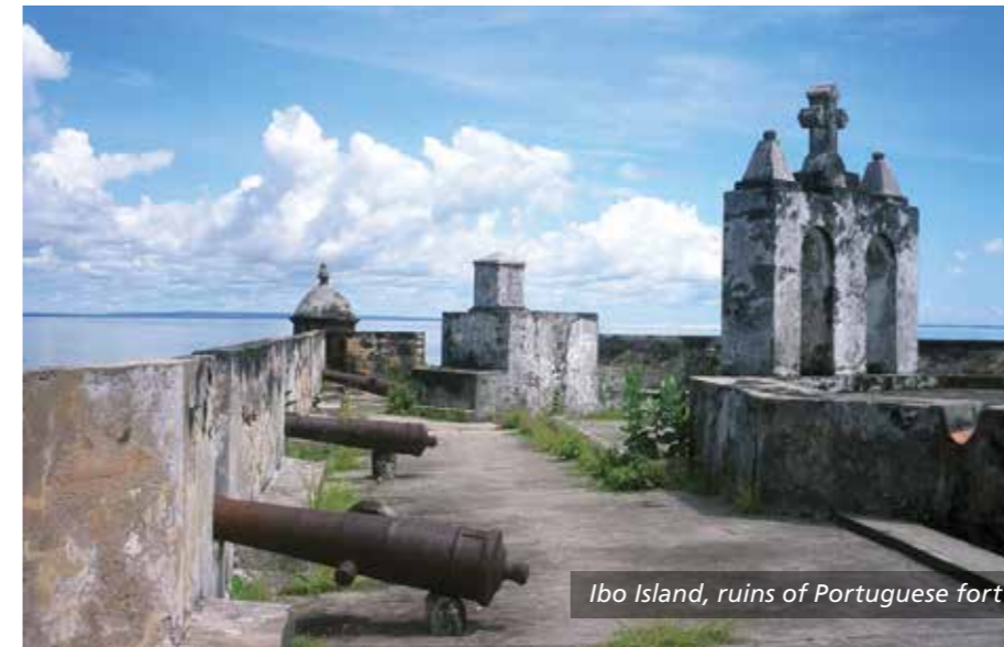
Ibo Island, ruins of Portuguese fort

Along the southern coast there are some quality beach resorts at towns such as Ponta Mamoli, offering superb dive sites and the chance to swim with wild dolphins. Currently the road is extremely poor and requires a 4x4 vehicle, but a new road is being built that will link Maputo to Durban. This will transform access to this area, which combines easily with a safari in Zululand, in neighbouring South Africa.