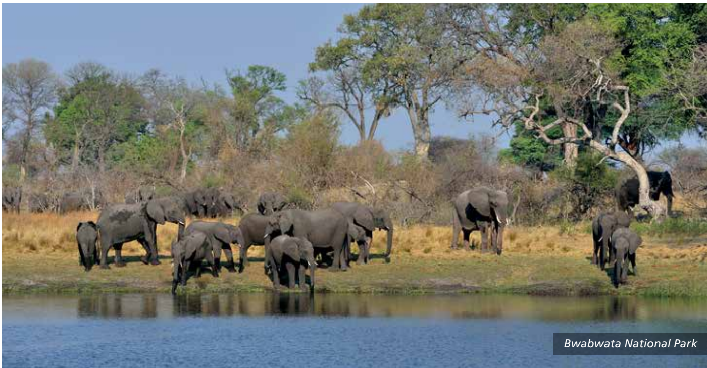
Bwabwata National Park

In the southeast, the vast Kalahari is another of Namibia's famous deserts, with its red sands and endless plains interspersed with acacia trees, grass and scrub vegetation, sustaining a surprising number of desert-adapted plant species. The migratory Bushmen who survive in this harsh environment call it the 'Soul of the World'.