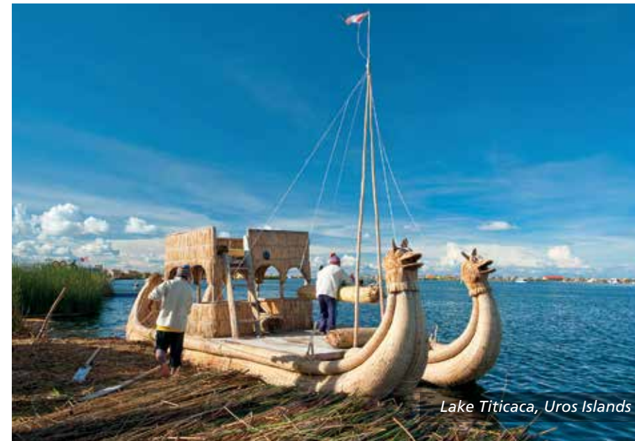
Lake Titicaca, Uros Islands

Arequipa is also the jumping off point for the spectacular Colca Canyon, one of the deepest in the world. Here you can watch the endangered Andean condor soar on the thermals, then have fun relaxing in the natural hot springs.