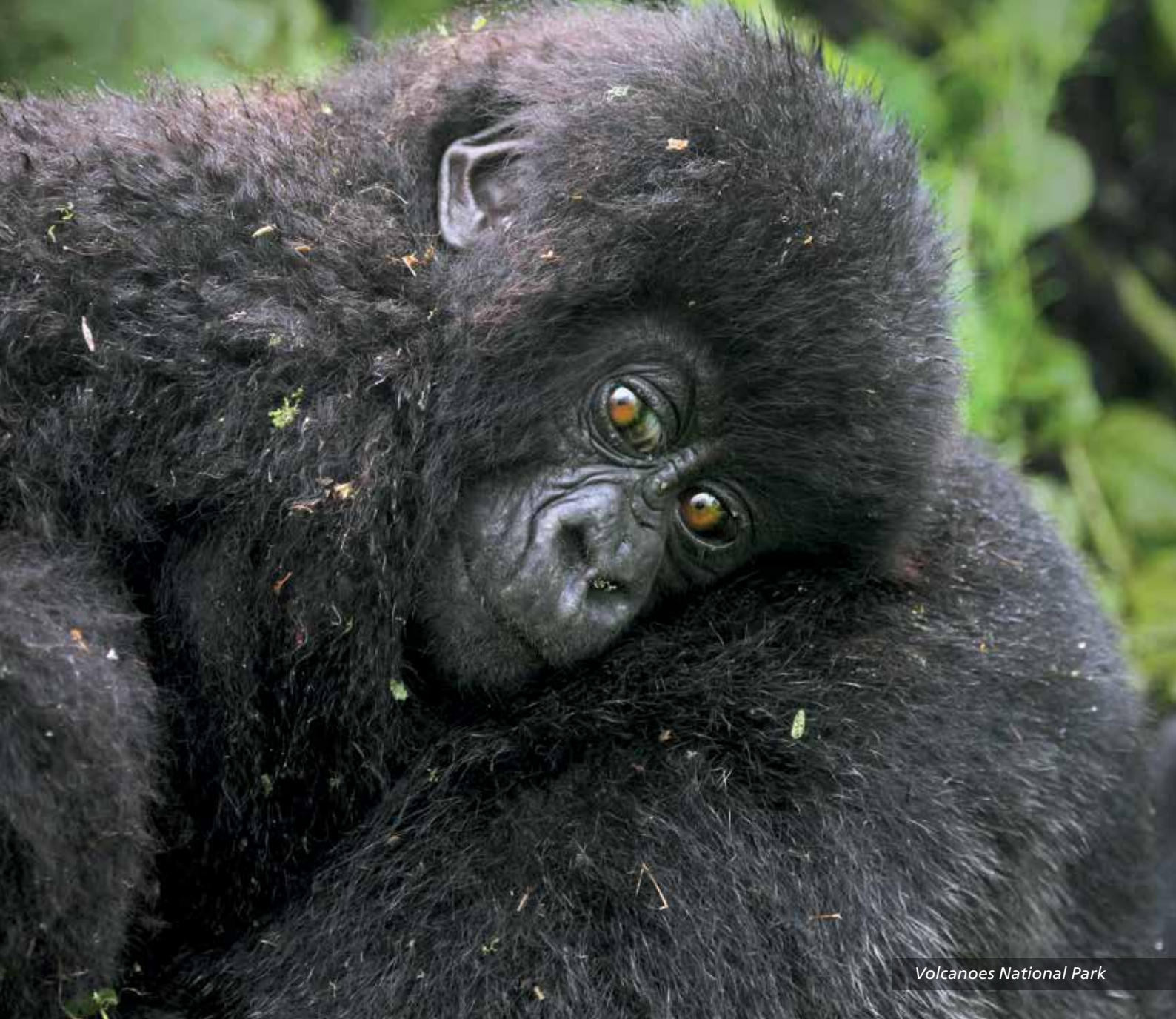
Volcanoes National Park