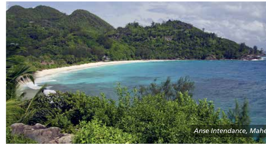
Anse Intendance, Mahé

Twenty-five miles to the northeast of Mahé, laid-back Praslin, the second largest island, is many visitors' idea of paradise with its white sandy beaches, massive granite boulders and swaying palm trees. Vallée de Mai Nature Reserve is famous for its huge Coco de Mer palms and Anse Lazio beach is world-renowned. Nearby, mountainous La Digue is the third largest of the inhabited granite islands. Here the beaches are wild and secluded, and traditional ox carts are still used.