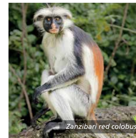
Zanzibari red colobus

This is an example itinerary – see page 5 for key. For more ideas, information and prices call us on 01582 766122 or visit www.2by2holidays.co.uk