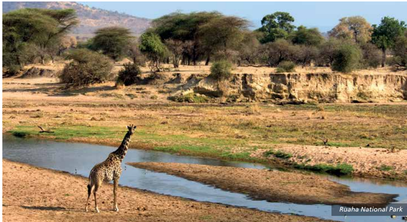
Ruaha National Park

At over 18,000 square miles, Southern Tanzania's vast Selous Game Reserve (now known as Nyerere National Park) is the largest in Africa. Less visited than the northern parks, the bush in the Selous feels wilder, more remote and denser.