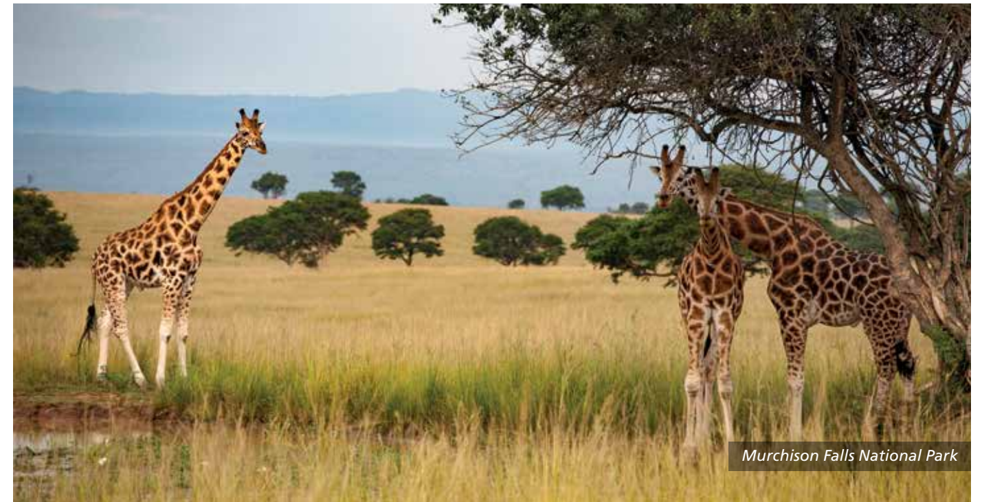
Murchison Falls National Park

You must be over 15 years to track gorillas and not have any colds or infections, as they have little immunity to human germs. It’s essential to wear good walking boots, long trousers and gloves for protection, as you scramble through the forest. Consider paying a porter to carry your backpack as you need to carry 2-litres of water, a packed lunch, rain gear