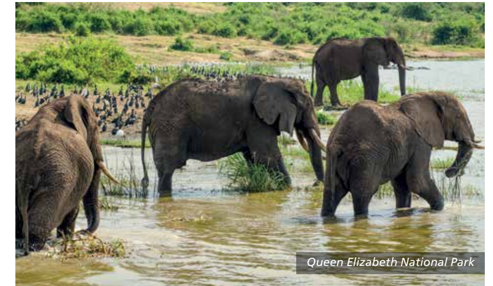
Queen Elizabeth National Park

A gorilla safari in Uganda is not complete without viewing the chimpanzees of Kibale Rainforest, the river-based wildlife of Queen Elizabeth National Park and the tree-climbing lions of Ishasha.