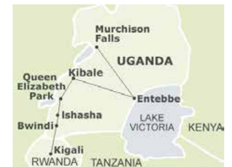
Pearl of Africa

Jinja is the place to go for adrenalin activities. Here the Nile River has its source and its thundering rapids, up to grade 5, offer some of the safest white water rafting in the whole world, as there are no submerged rocks, hippos or crocodiles. Afterwards visit the Chimpanzee Sanctuary on Ngama Island and relax on the shores of Lake Victoria, with over 3,000 islands.