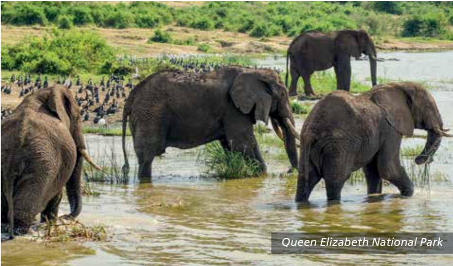
Queen Elizabeth National Park

A gorilla safari in Uganda is not complete without viewing the chimpanzees of Kibale Rainforest, the river-based wildlife of Queen Elizabeth National Park and the tree-climbing lions of Ishasha.