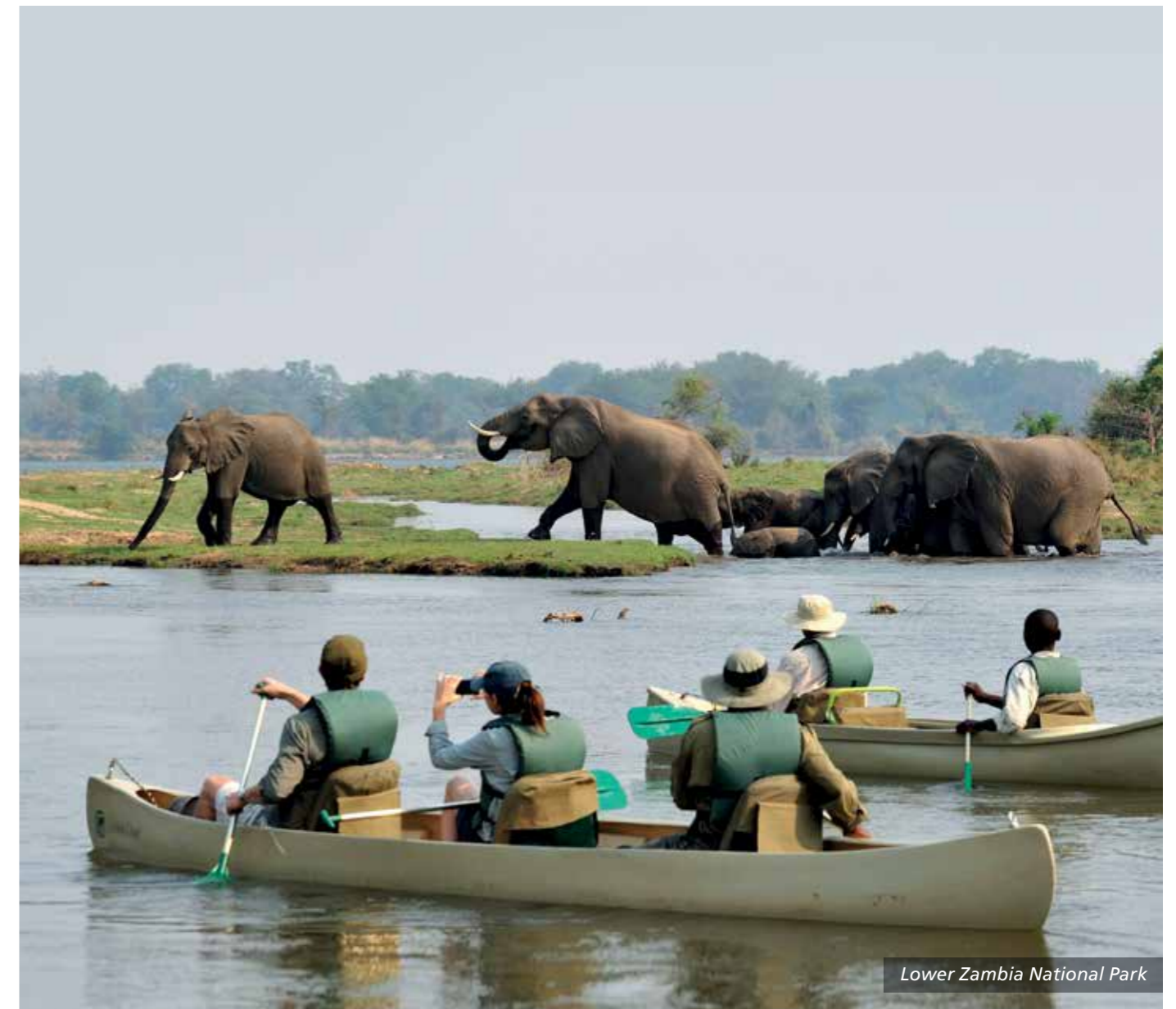
Lower Zambia National Park