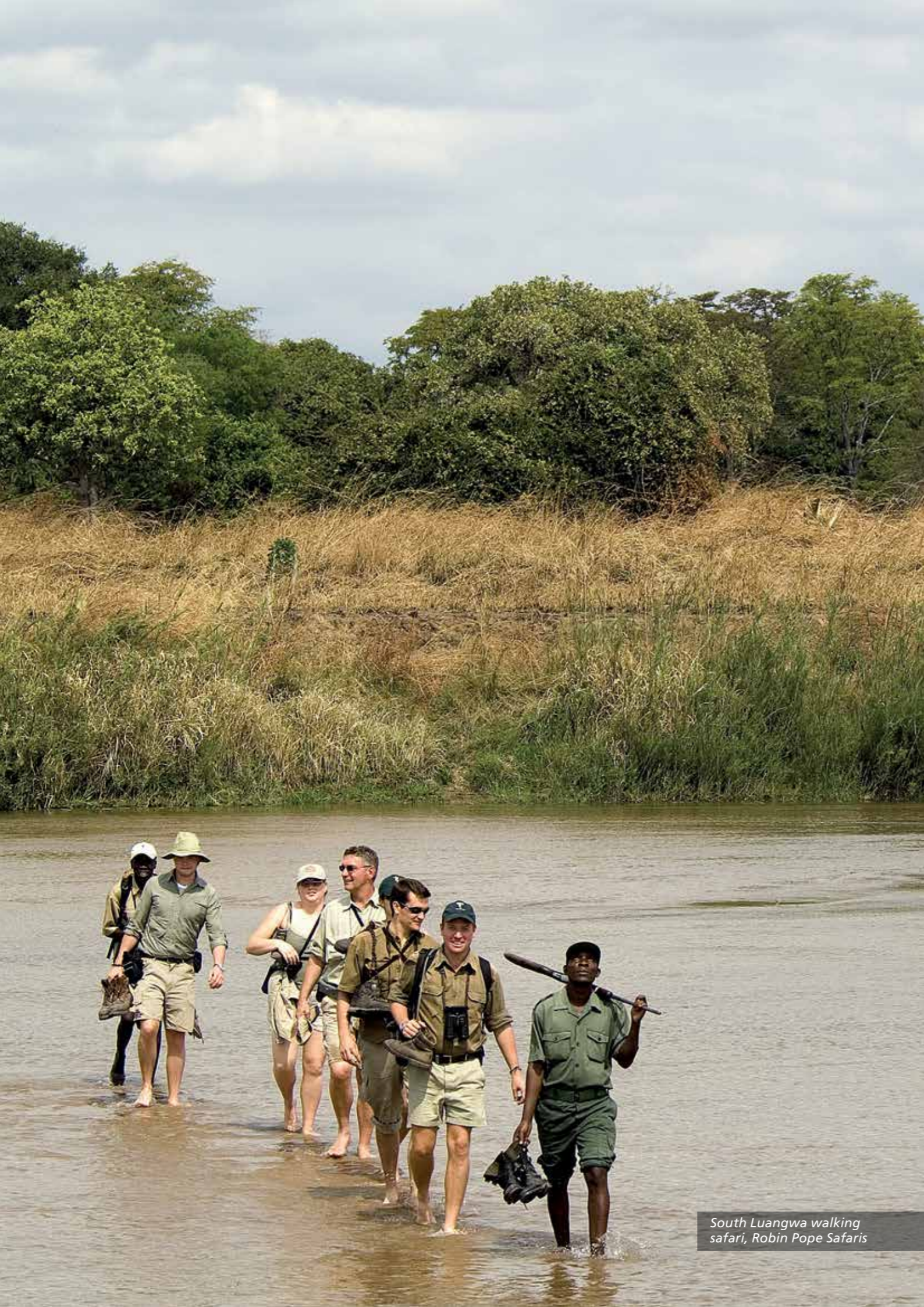
South Luangwa walking safari, Robin Pope Safaris