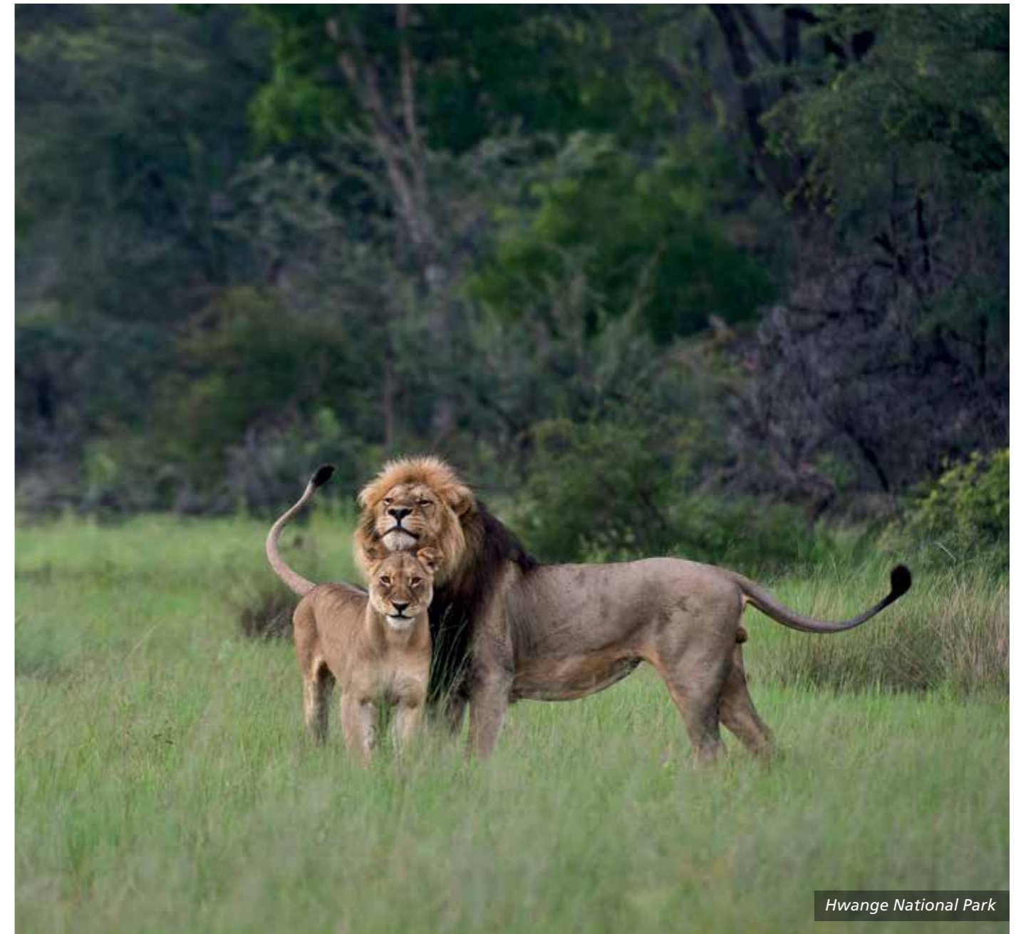
Hwange National Park

The magnificent views of the world-famous Victoria Falls from the Zimbabwean side are arguably without parallel. A Big Five safari in Hwange, one of Africa's most iconic national parks, is unforgettable.