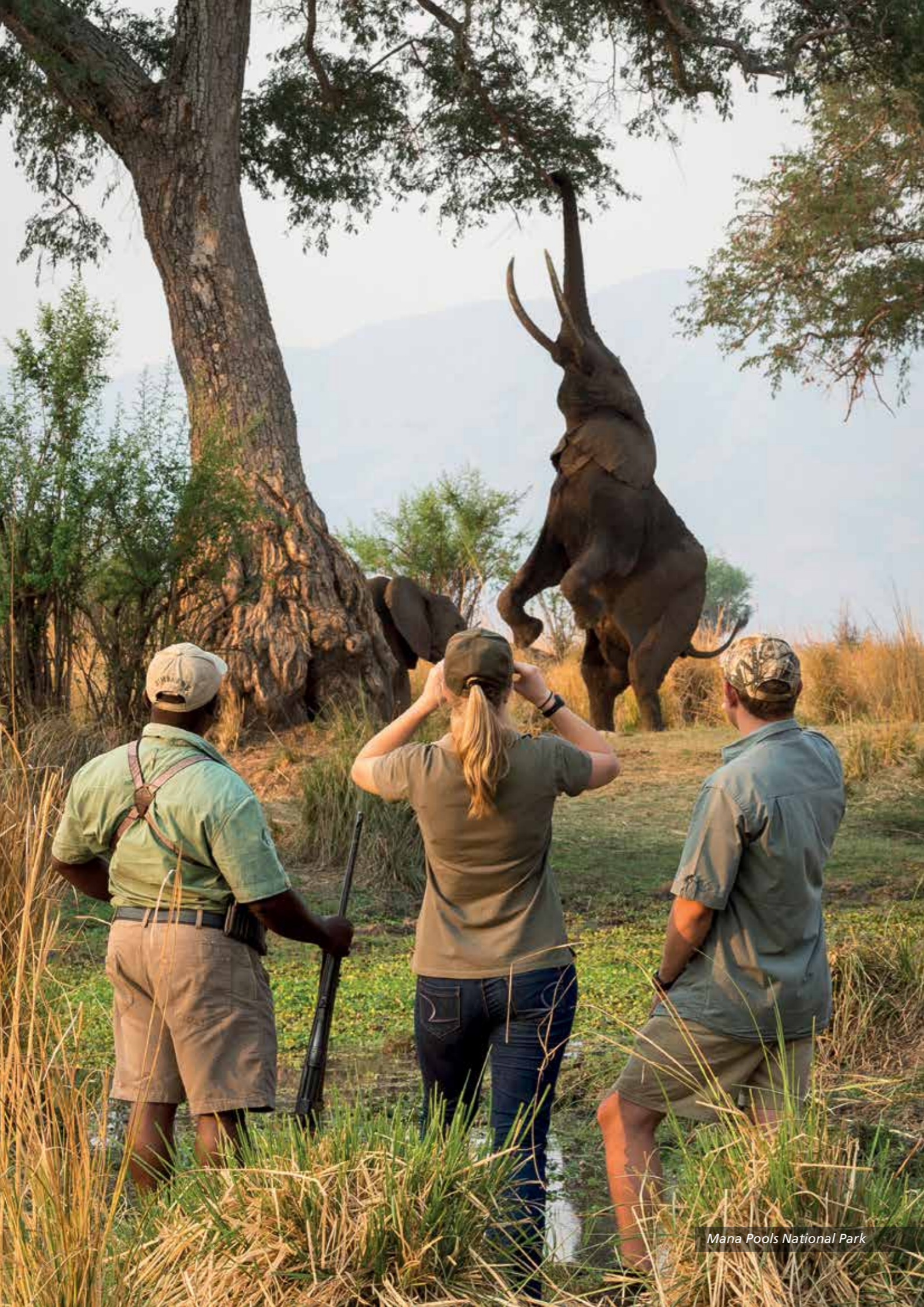
Mana Pools National Park

Easy to reach from the capital city of Harare, vast Lake Kariba was formed by the creation of the Kariba dam. Popular with locals and tourists alike, visitors can canoe, kayak and fish as they soak up the sunshine. Tiger fishing is particularly good with international competitions held here annually. Sunrises and sunsets over the lake are spectacular and game viewing from the river is a delightful way to end the day. Accommodation is mainly on the east and southern shores of the lake and ranges from well-established lodges to laid-back houseboats.